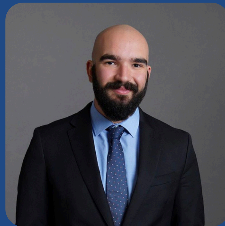
Demos - Trainer