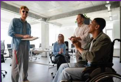
Business As Usual Inclusion