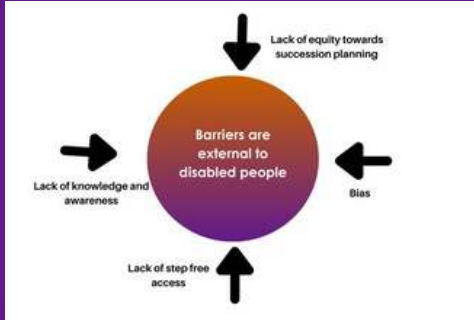
Social Model of Disability