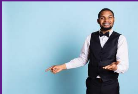
Great Customer Experience