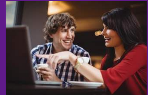
Neurodiversity at Work