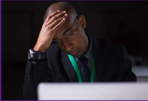
Mental Health & Well-being