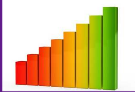
Business & Legal Case